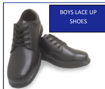
BOYS LACE UP SHOES