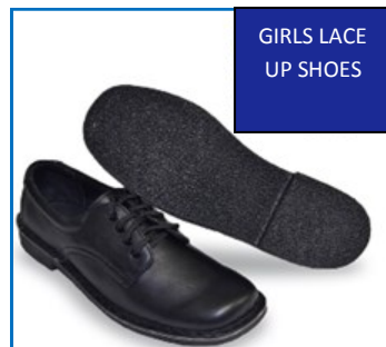
GIRLS LACE UP SHOES